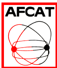
Association Française de Calorimétrie et d'Analyse Thermique